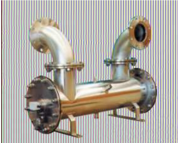
Watertec UV System

With over 10 years of experience in the design of disinfection and oxidation systems, Watertec is recognised internationally as a leader in Ozone and Ultraviolet (UV) disinfection systems.