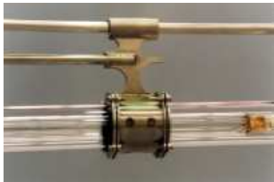
Unique quartz tube cleaning mechanism